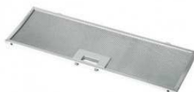
Metal grease filter

Metal grease filters can be cleaned in the dishwasher. Use the programme with the highest temperature. Dishwasher detergents can cause the grease filters to take on a slightly tainted, dull-grey appearance over time, but this does not affect functionality.